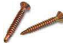
Fixing Screws (6)