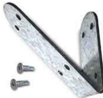
Bracket (8) & Bracket Screws (9)

Only required for some fence types; see page 10.