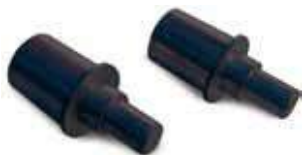
Axle Pins (4)